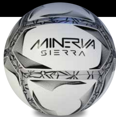
COLOUR: White / Silver / Black SIZE: 3, 4, 5