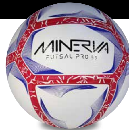
COLOUR: White / Magenta / Reflex Blue SIZE: 4 Official size

TPT (Ten Panel Technology) Machine Stitch Hybrid (Sealed Seams) Construction Synthetic Rubber Winding Bladder Target PU Textured Outer material