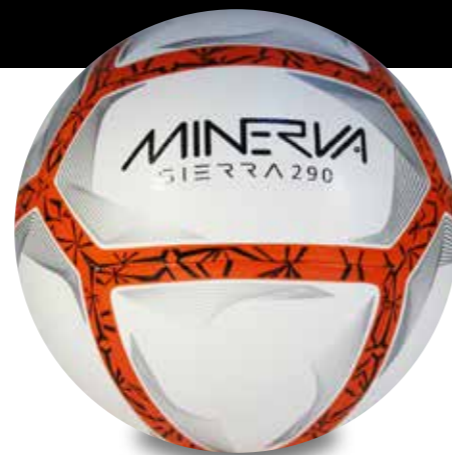
COLOUR: White / Red / Black SIZE: 5

TPT (Ten Panel Technology) Machine Stitch Construction Synthetic Rubber Winding Bladder TPE Textured Outer material