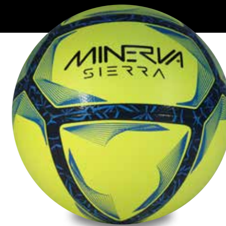
COLOUR: Fluo Yellow / Cyan Blue / Black SIZE: 3, 4, 5

TPT (Ten Panel Technology) Machine Stitch Construction Synthetic Rubber Winding Bladder TPE Textured Outer material