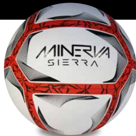
COLOUR: White / Red / Black SIZE: 3, 4, 5