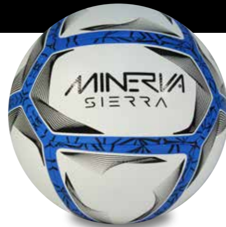
COLOUR: White / Cyan Blue / Black SIZE: 3, 4, 5