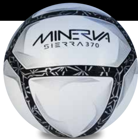
COLOUR: White / Silver / Black SIZE: 5