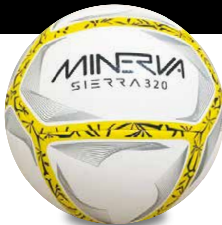
COLOUR: Fluo Yellow / White / Black SIZE: 5