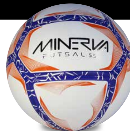
COLOUR: White / Reflex Blue / Orange SIZE: 4 Official size

Futsal Training Ball: Same spec as the Pro 55 ball except: Campus Vimini Textured Outer material.