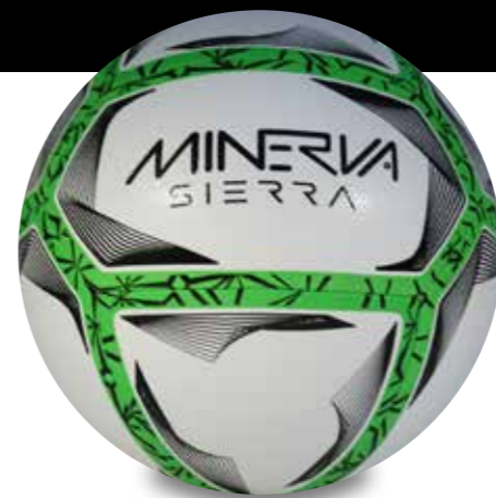
COLOUR: White / Fluo Lime / Black SIZE: 3, 4, 5